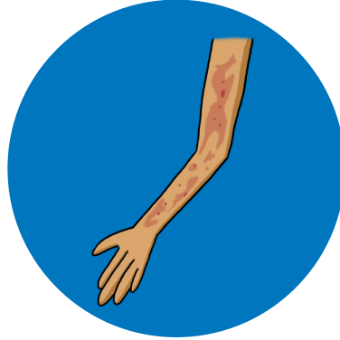
Burning, and stinging